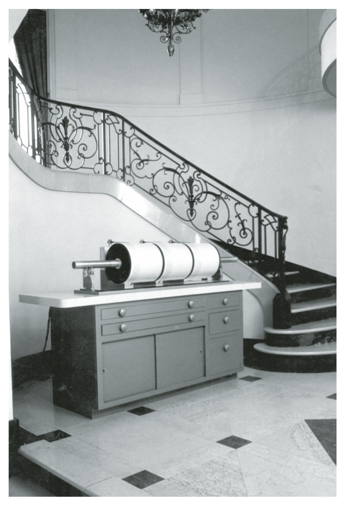
The marble spiral staircase at the Donnelly laboratory in the 1960s. The three drums recorded vertical, north-south, and east-west motion measured by a Benioff short-period seismometer located in a tunnel some 50 to 100 feet below. The drums made it possible to analyze earthquakes immediately, without waiting for photographic seismograms to be chemically developed.